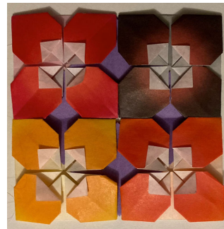
Figure 2: Flower Quilt.