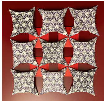
Figure 1: Jellyfish Quilt for a 13th birthday gift.

The second method, one of the most productive strategies for producing interesting integer results, is not focused on total number of pieces of paper, but on color. This technique does not work for all integers, but only for those integers that are the solution to an (n \text{ choose } m) = x equation where n = a specific number of colors, m = how many different colors are chosen at a time, and x = the total number of unique sets of m colors that can be formed from these n colors. We call these numbers “combinatorial numbers.” For example, a gift for someone turning 15 could be made by starting with 6 colors of paper, choosing 4 at a time (thus n = 6 and m = 4 ). The number of unique sets of 4 colors is 15 (i.e., x = 15 ). We then form 15 different origami squares using each of the sets of 4 colors and interlocking the squares together (no separate connectors needed). Figure 4 shows the quilt made using this method. Gifts for quite a few other birthdays (e.g., 21, 35, 56, and 70) can be made using this technique.