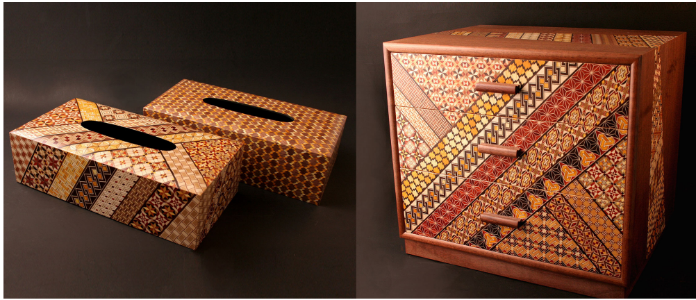
Figure 1: Examples of Yosegi Zaiku. These two pieces are samples of the work of the Japanese master Ichiro Ishikawa of Hamamatsuya in Hakone, Japan [1]