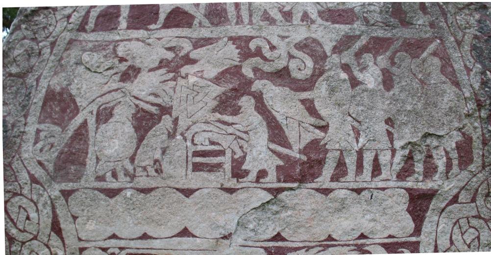
Figure 2: Example of the Borromean Rings appearing as a Valknut. This example is from one of the 7 th -century Stora Hammars stones in Gotland, Sweden [2].