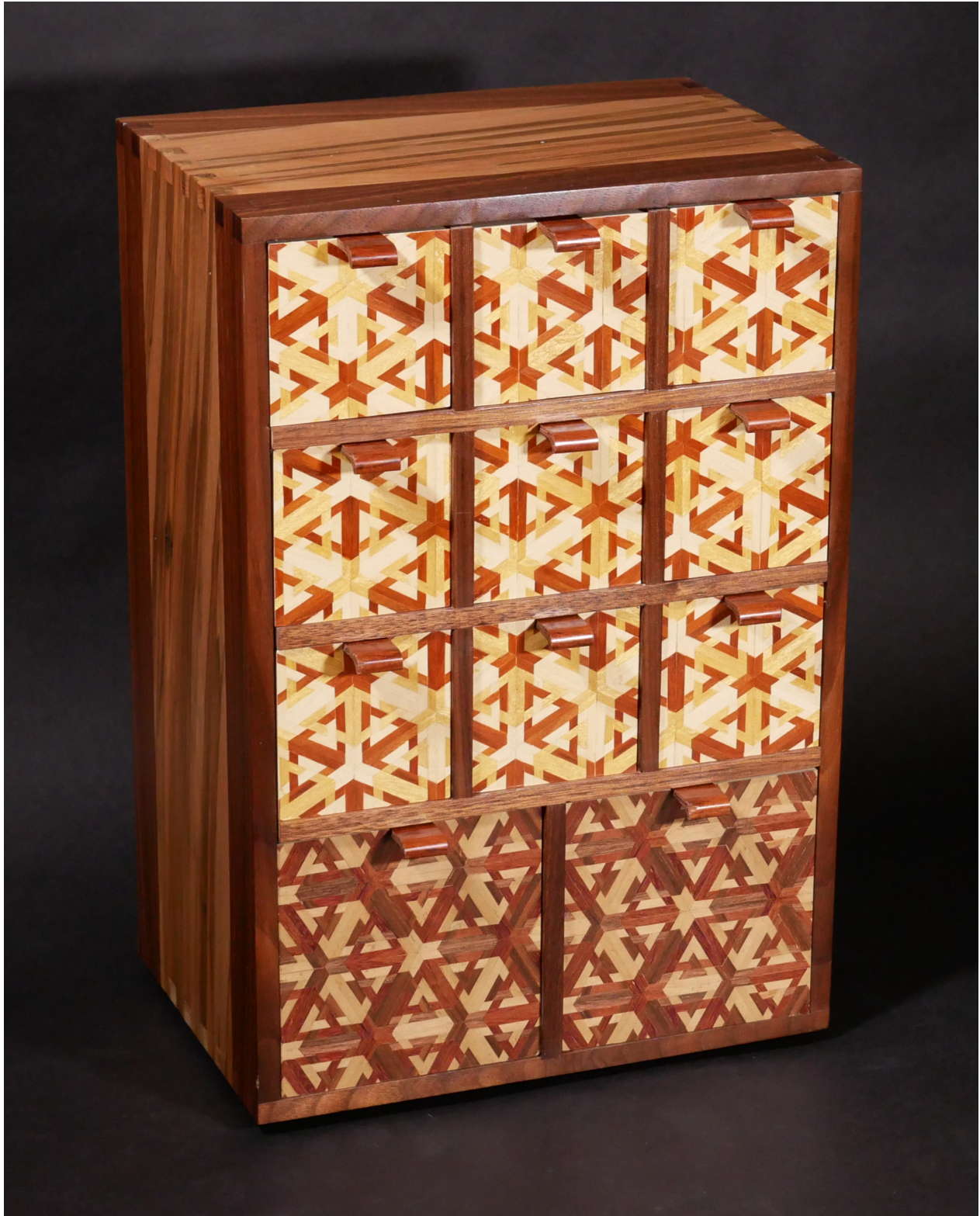
Figure 5: Example of both versions of the Borromean Rings Yosegi used to decorate an Apothecary cabinet[3]