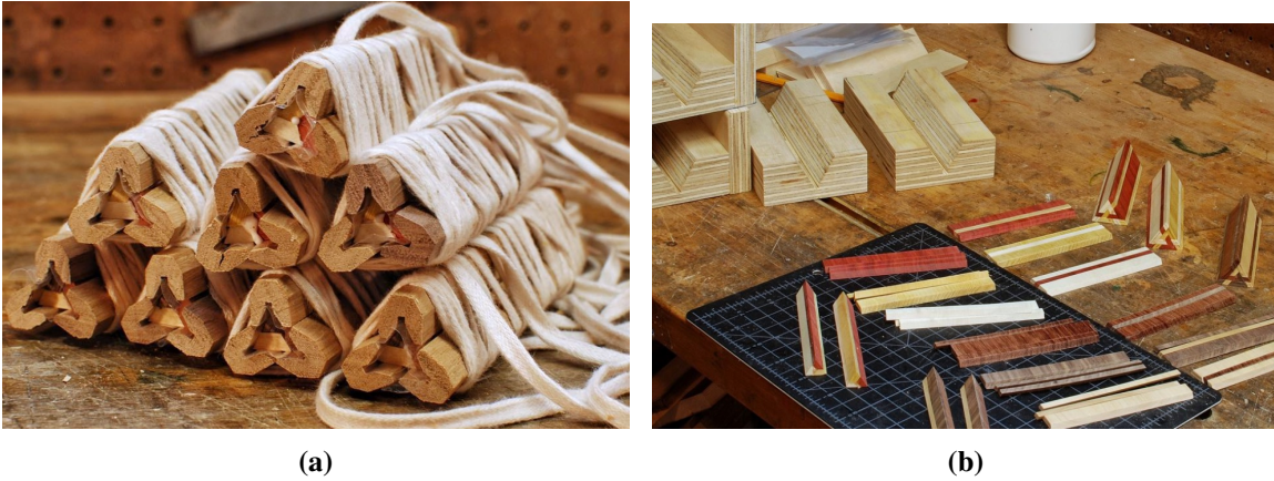
Figure 3: Building up the layers of the Borromean rings pattern cell. (a) the three pieces of the inner layer, glued and "clamped" via cauls and tightly wound cord, (b) building the middle layer on top of the inner layer