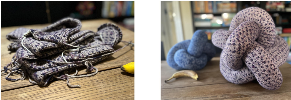
Figure 3: Work in progress and completed 8_{18} knit knot, banana and figure-eight knot for scale.

Notice that to repeat the same style of knit knots as our prototype with the same machine, needles, and yarn (Loops & Threads “Impeccable Speckle”), we will always have the same \mathfrak{r} , r , and \rho , and therefore we can just multiply any ropelength bound R by 1.67 \cdot 1.045 \cdot (8.5/2) \approx 7.417 to obtain an ideal row count \mathcal{R} . The purpose of Theorem 1 is to generalize the process for other yarns, machines, and styles.