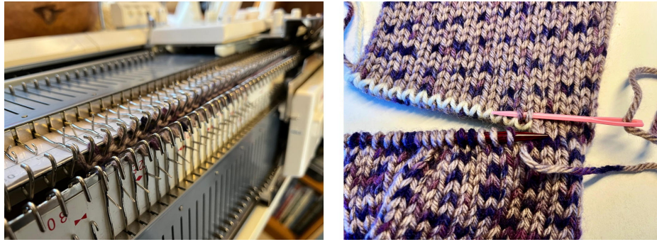
Figure 4: Knitting the work on a Brother KH-260 knitting machine with KR-260 ribber bed, and grafting separate pieces together

yarn and desired tension. Set main bed to slip L and ribber to slip R, and knit in the round for \mathcal{R} rounds or until a problem happens and the knitting falls off or jams unexpectedly. If you make it to the end then knit a few rows of waste yarn before dropping the work from the machine. For more detailed instructions see [6].