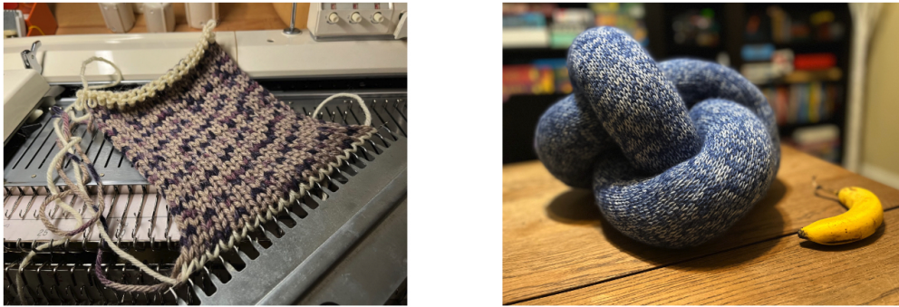
Figure 2: Flat tube knitting sample and completed figure-eight knit knot, banana for scale.

As an initial prototype we machine knitted and stuffed the figure-eight knot; see the photograph in Figure 2. This prototype was used as the basis for all physical measurements and the standard for future knit knots. The knit tube was 39 stitches around and 314 rows long, with a knit gauge of 8 stitches and 11 rows per 2"x2" square, un-stuffed tube circumference of 39 \cdot 2/8 = 9.75'' , and un-stuffed flat length of 314 \cdot 2/11 = 57'' . Note that nearly five feet of knit tubing was needed to construct even this simple knot!