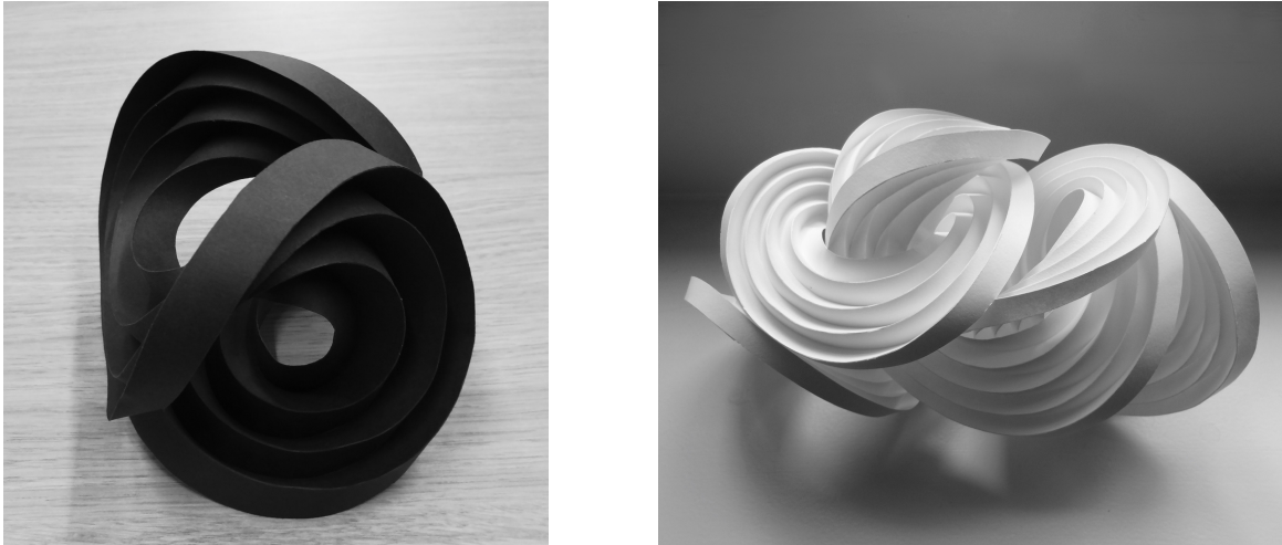
Figure 3: When a flat paper ring is folded along concentric circles the paper shapes itself into a natural equilibrium form (left). By combining several curved rings one can create paper sculptures.

concentric circles on it. These circles are then carefully folded with an alternating pattern of mountains and valleys. Paper is an elastic material and tries to stay flat unless creased, in which case a plastic deformation occurs. To balance the two forces (staying flat between folds while folded at the creases) the above model automatically folds into a curved 3d-shape as shown in Figure 3 on left. Notice how the circumference of a creased circle stays the same while it moves closer to the origin, making the radius smaller. The mathematical behaviour (or even existence) of these models is still an open question [1, 2]. The earliest references to curved folding sculptures are from 1927 with a student's work at the Bauhaus. Since then, the technique has fascinated several artists and mathematicians including Thoki Yenn, Kunihiko Kasahara, David Huffman, and Erik and Martin Demaine. Even though the curvature is not necessarily constant, these models offer a different way of understanding negative curvature and allow students to get creative.