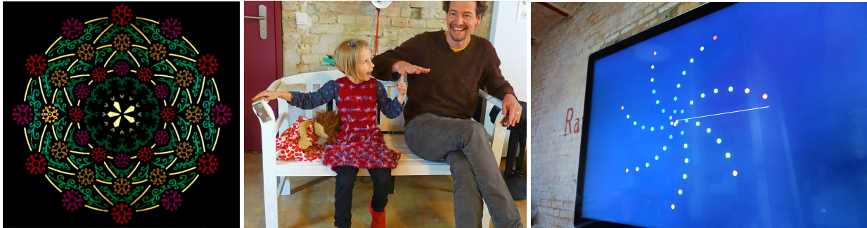
Figure 3: Pentatonic Scales, Musical Bench, and Whitney Music Box.

computer science like the most. We asked mathematicians and researchers from the “Women of Mathematics throughout Europe” exhibition project [7], and recipients of the most prestigious awards in mathematics and computer science [1], to fill the jukebox with their favourite music pieces. Visitors can also get inspired by pure mathematics by hearing numeric patterns in the exhibit The Sound of Sequences . Numerical sequences taken from the Online Encyclopedia of Integer Sequences (OEIS) [6] are mapped onto sounds that can be heard, revealing features of the sequence but also creating “music” pieces interesting in their own right.