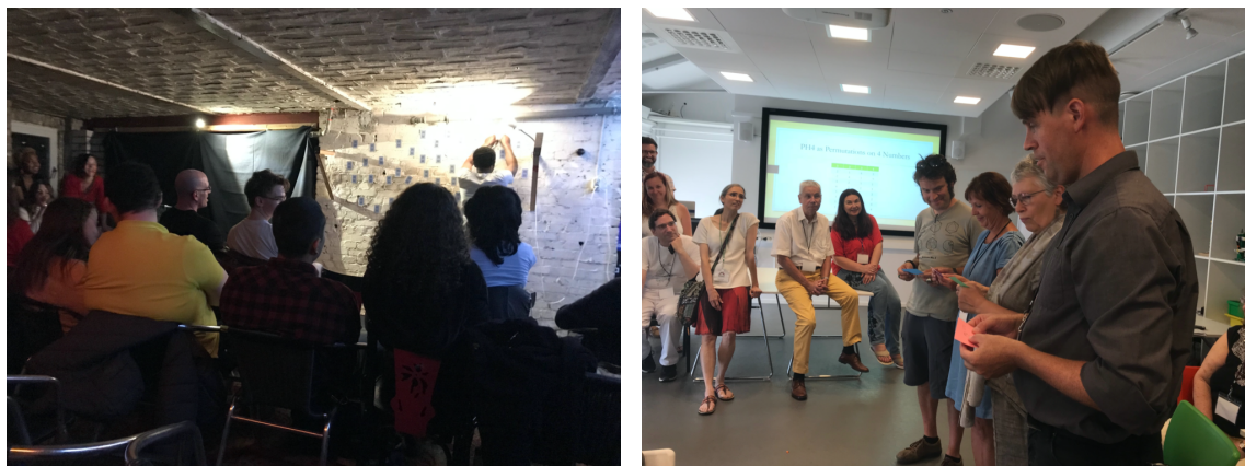
Figure 2: PH4 mathematical poetry workshops at Du Beast (Berlin, 2019) and Bridges 2018 (Stockholm).

Here is a new example of a multi-stanza poem (with apologies to Robert Frost) based on these processes, where each stanza has been composed using the Braided Bellringing PH4 form. (Several other examples can be found in the 2020 Bridges Poetry Anthology [9].)