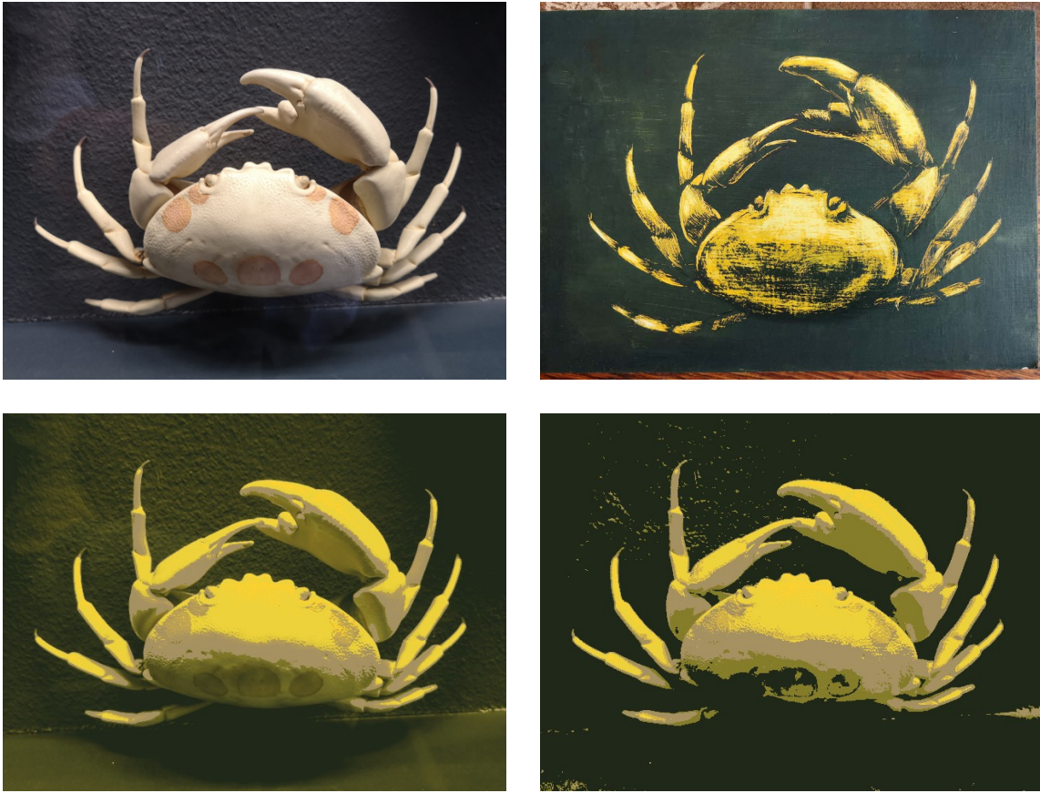
Figure 8: Original photo (upper left), sgraffito rendering (upper right), continuous palette (lower left), 7-color palette (lower right).

Finally, we remark that while the posterization technique is not new, one of the goals was to simulate it in an open-source platform so it can be incorporated into future semesters of a mathematics and digital art course ([1]).