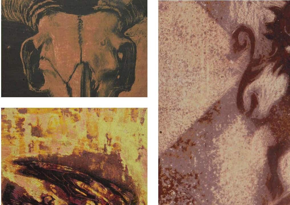
Figure 3: How application of the paint changes the texture of the paint using a paint brush (top left), palette knife (bottom left), and paint roller (right).

brighter than if they were used by themselves.