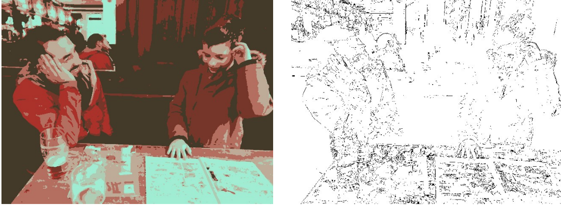
Figure 6: Smoothed 7-color palette (left), pixels changed (right).

image. Figure 7 shows an example where a bolder color palette is used, though the colors are not present in the original picture.