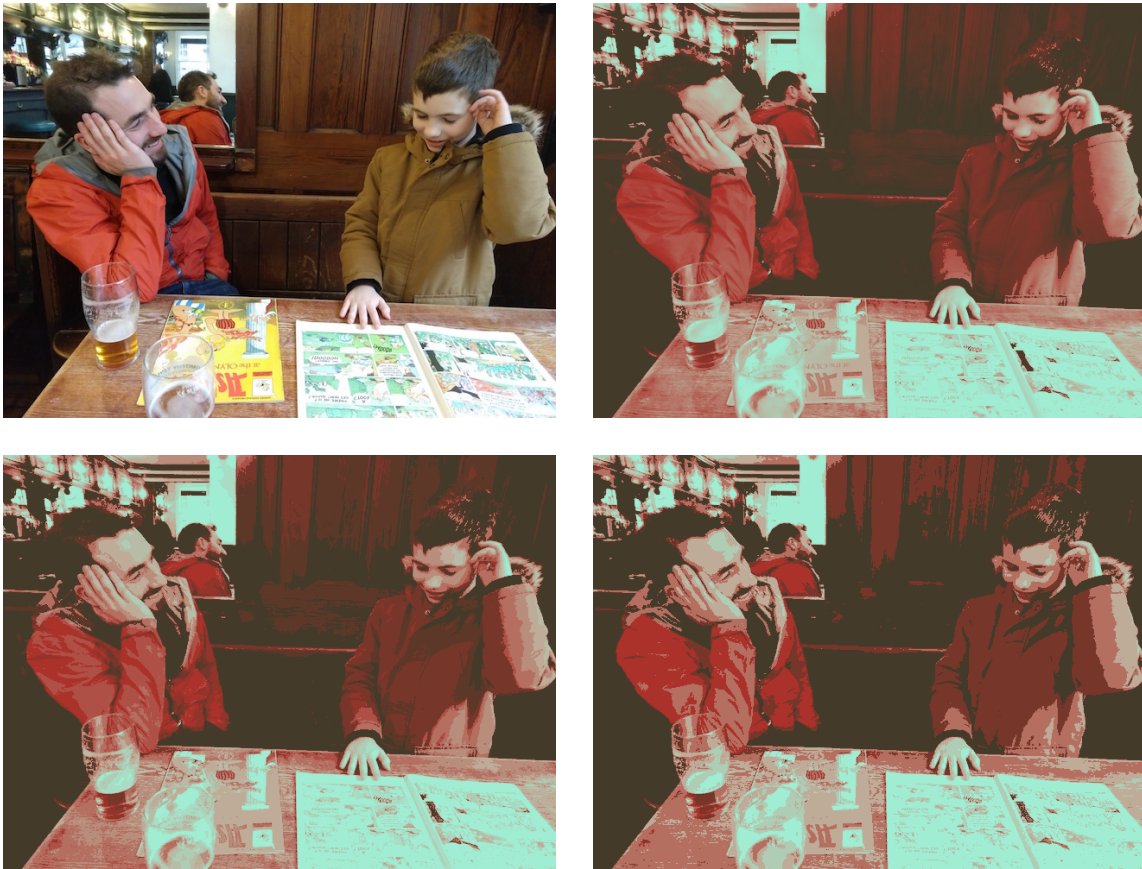
Figure 5: Original photo (upper left), continuous palette (upper right), 13-color palette (lower left), 7-color palette (lower right).

segment. But when c is projected on the line containing the segment joining c_2 and c_3 , the projection lies exterior to the segment, so we use the endpoint c_3 as the closest color on the segment in this case.