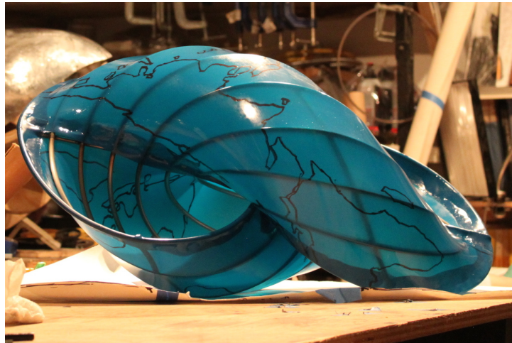
(b) The 0^\circ longitude line passes through west Africa.