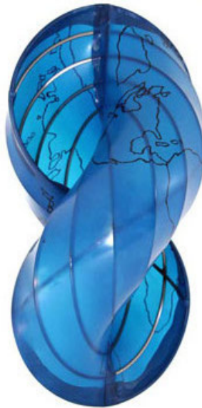
Figure 1: To the World's End/ A Circle Bundle Over a Circle Lun-Yi Tsai and Zachary Treisman, 2010 Stainless Steel and Latex, 12"×12"×24"

The sculpture To the World's End/ A Circle Bundle Over a Circle is an illustration of the geometry of the Klein bottle and the operation of blowing up in algebraic geometry. An image is featured in Loring Tu's new book Differential Geometry .