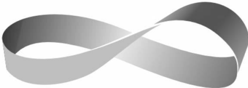
Figure 1: Image of the Möbius band.

The Möbius band (Figure 1) is geometric figure was discovered independently by the German mathematicians August Ferdinand Möbius and Johann Benedict Listing in 1858, owing its name to the first of them [3]. It is a single-sided and single-edge surface. To understand this, the best example is to see what happens if the problem of coloring the supposed external face of the band is considered. After solving this problem the whole band will be colored. Therefore, it does not make sense to talk about the inside face and the outside face. In addition, if you try to go over the edge with a finger, you can see that at some point you go back to the beginning, which shows that this edge is unique. Another very interesting property of the band is that it is a non-orientable surface, which means that one moves parallel along the length of the band, the beginning is reached again with the inverted orientation. Therefore, a person who moves lying over a Möbius strip looking to the right, will appear looking to the left after making a complete turn.