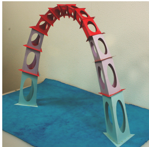
Figure 6: Paper catenary assembled.