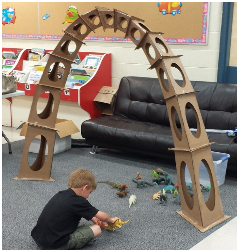
Figure 7: The cardboard catenary, 4.5 feet tall, fits well in a classroom environment.

Accurately cutting cardboard sheets into the required components is best done with a laser cutter. We realize that many educators do not yet have access to this technology, but we are optimistic that laser cutters will become more and more available in the near future. Meanwhile, the template can be traced and cut with a knife.