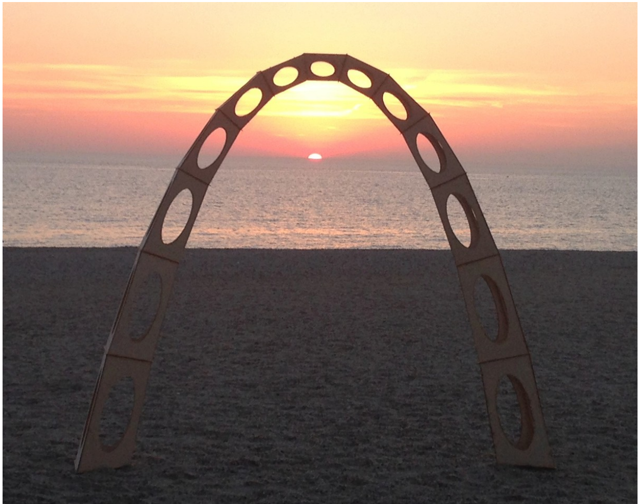
Figure 8: Wooden catenary on the beach at sunset. 6.5 feet tall.

In Figure 8 the arch is unstained, giving it a very natural look. However, we have found that applying water-based stain, as shown in Figures 1 and 9, adds a certain richness and visual impact.