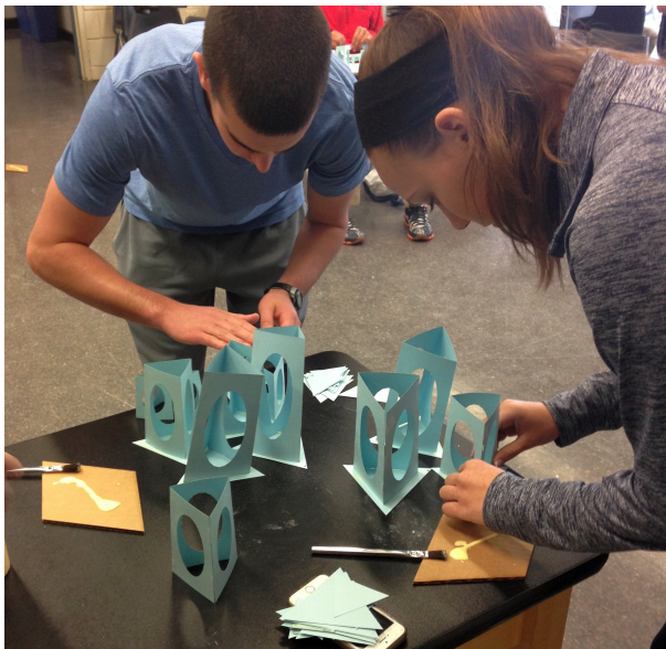
Figure 5: Paper catenary assembly.

When we have tried this with student groups, we have observed their enormous satisfaction upon completion. Figure 5 shows the separate pieces under construction and Figure 6 shows the paper catenary in its assembled form. Note that the thirteen separate pieces are just resting on each other, held together by their own weight, not glue or tape. A light touch or breeze will cause the construction to collapse. Participants typically require many attempts before they can get everything to balance just right, which makes the moment of success all the more joyful.