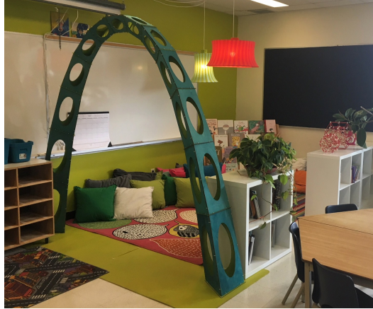
Figure 9: Wooden catenary as entrance to classroom reading nook. 6.5 feet tall.