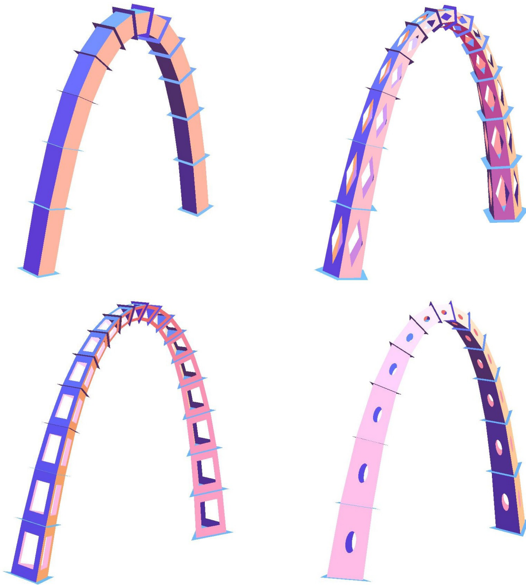
Figure 2: Four possible realizations of a catenary arch: (a) square in cross-section, un-tapered, with no openings; (b) pentagonal with diamond openings; (c) triangular with rectangular openings and 18 segments; (d) triangular, pointing upward, with small elliptical openings.

anchored to the earth while gracefully reaching for the sky. Figure 2b shows the improvement afforded by a taper, while experimenting briefly with a pentagonal cross section instead of a square. In addition, diamond-shaped openings are introduced.