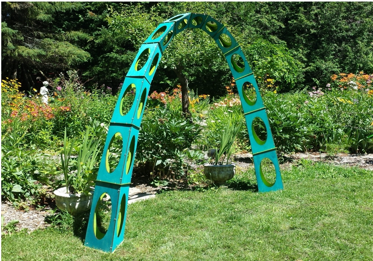
Figure 1: Catenary arch of laser-cut wood (stained) and cable ties, 6.5 feet tall.

In our ongoing pursuit to find beautiful ways to make math visible, [1] we were inspired during a visit to St. Louis, to create our own artistic rendition of the engaging catenary form. Eero Saarinen's majestic arch seemed like a natural gateway for inviting viewers to think about math, to ask questions, and to ignite mathematical discussion. Figure 1 shows the result of our project, a wooden walk-through catenary arch that anyone can replicate by using the instructions and laser-cutting templates we have created. [2]