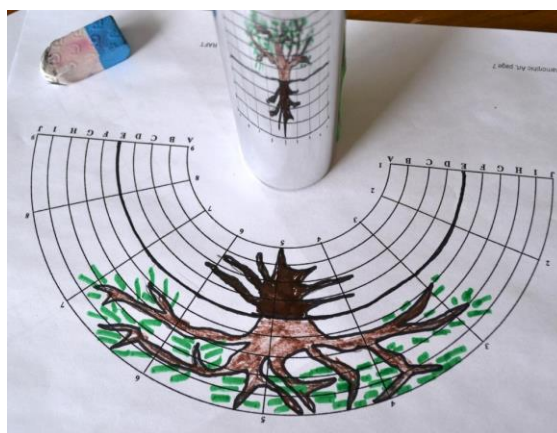
Figure 2: A drawing from a rectangular grid was mapped onto a polar coordinate system; the distorted drawing is transformed into a recognizable image by reflection in a cylindrical mirror.

Make an anamorphic design. Participants will make their own picture in the Cartesian grid and transfer the design into a polar grid by mapping the points from one system of coordinates to the other (Fig. 2). The cylindrical mirror will then be used to view and enjoy the final art work. This activity introduces younger students to coordinate systems and motivates them to use coordinates to locate and reproduce images. From the artistic point of view this activity has a great potential to allow students express their artistic abilities through experimentation with color, effects, and materials. Depending on students abilities they can be asked to color pictures in the polar grid, transfer and color an (already drawn) image from a Cartesian grid to a polar grid, or in the case of artistically advanced students, hand-draw an image without the guidance of a grid.