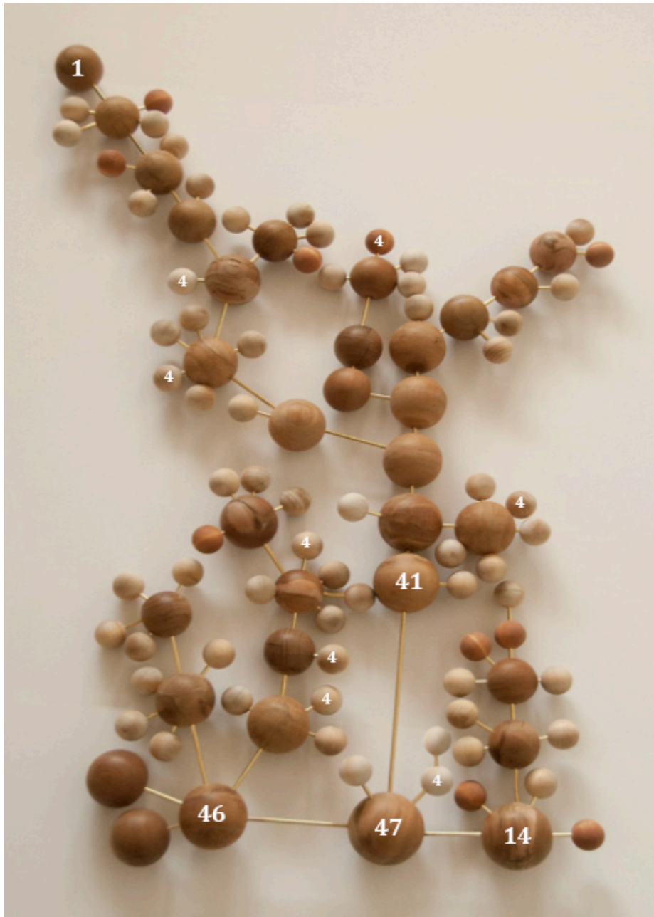
Figure 3 3-D Rendering of 2-D Rooted In-tree Graph of the Proof of the Pythagorean Theorem, Euclid, Elements, Book 1

1.47 is itself “proven.” If, however, a proposition appears more than once, then we cite it, that is, it becomes a node in the graph but is not proven again. This approach fills out the logical dependencies and allows analysis, e.g., of the number of times a proposition, definition, common notion, or postulate is a branch on the deductive tree. For example, 1.4 appears eight times in the tree, but we prove it only once. In our tree, we have branching that goes for 39 levels. Also, we can determine the distance any proposition is from the root and calculate accumulated distances, greatest distances, and least distances—all information about 1.47’s toolbox contents. Much of this data we have summarized in Excel bar graphs (not pictured here).