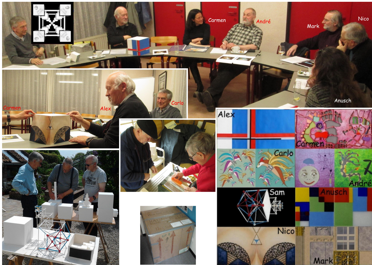
Figure 1: 'Making of' work for Bridges Baltimore 2015

To further hint at the involvement of the RAM-8 Groep in Zometool, the series of reducing cubes starting with this open one is mainly realized in white Zometool inventory and only holds together thanks to the 'yellow' struts. The 5 th cube (and last because the smallest possible strut before 'kissing balls' doesn't presently exist) having about the right proportions of the Atomium, represents the Zometool model that appeared on the back cover of the Bridges London 2006 Proceedings, with color struts and chromed balls.