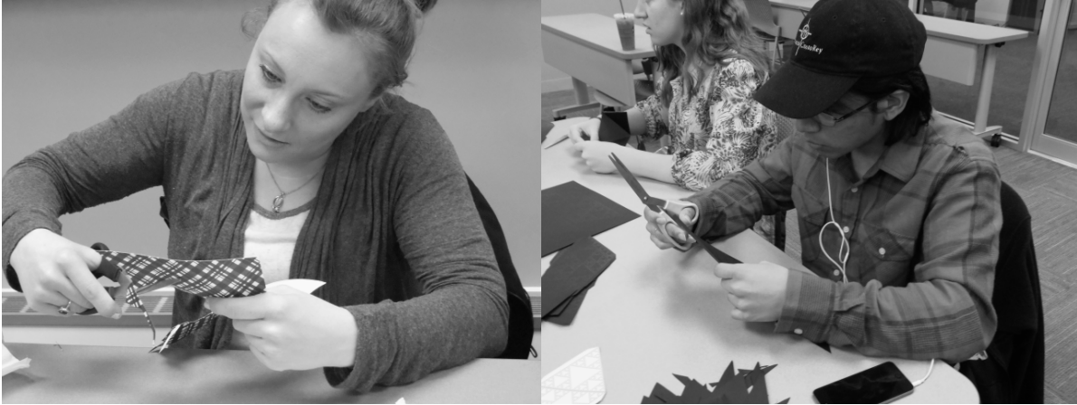
Figure 4 Cutting the nets for the tetrahedrons.

This workshop provides an opportunity for participants to try this out and take the concept back to their classroom or campus. Template nets available online in various sizes and designs will be used to create the tetrahedrons for the construction of the Sierpinski tetrahedron [4,5]. The benefit of this type of workshop experience is that the final design and concept will have gone through at least a couple iterative stages of design process, resulting in a smoother adaptation to individual contexts. There are multiple choices to make in terms of color, paper weight, and maintaining structural integrity. Tetrahedrons will be constructed and then combined to form larger ones, culminating in a Stage 2 or 3 Sierpinski tetrahedron that participants can take with them. Once the sculpture moves beyond Stage 4, there are also considerations as to how to support the structure to keep it from collapsing.