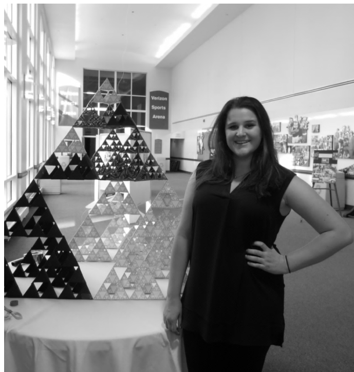
Figure 1: Student-created Sierpinski tetrahedron sculpture.

This workshop for Bridges participants will explore mathematical topics related to undergraduate geometry embodied in the Sierpinski tetrahedron. Come prepared to create a Stage 2 or 3 Sierpinski tetrahedron. Participants will be able to decide how best to structure and tailor the assembly and display process. There will be a variety of choices in terms of paper weight and designs. All materials provided.