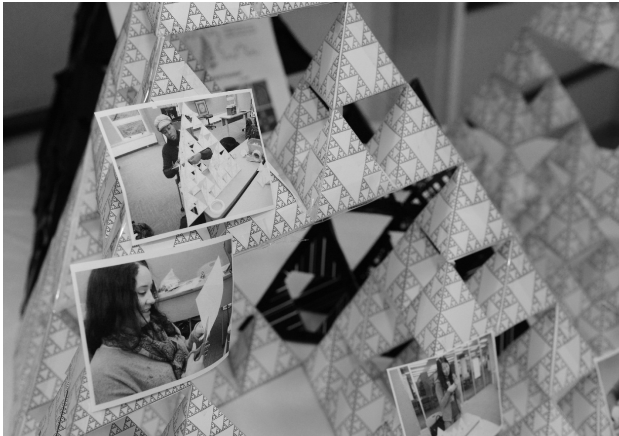
Figure 5 Sierpinski Tetrahedron close-up.

Link to workshop handouts: http://tinyurl.com/mm5erkw