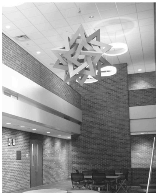
Figure 1: Sunshine

The author recently completed her first large metal sculpture. Sunshine (figure 1), a five-foot diameter rendering of five intersecting tetrahedra in powder coated aluminum, was inspired by Tom Hull's origami model of this polyhedron. The piece has been installed in the Copley Science Center at Randolph-Macon College, where it hangs from the ceiling in the two-story entrance hall. This paper tells the story of attempting an ambitious project with no prior experience.