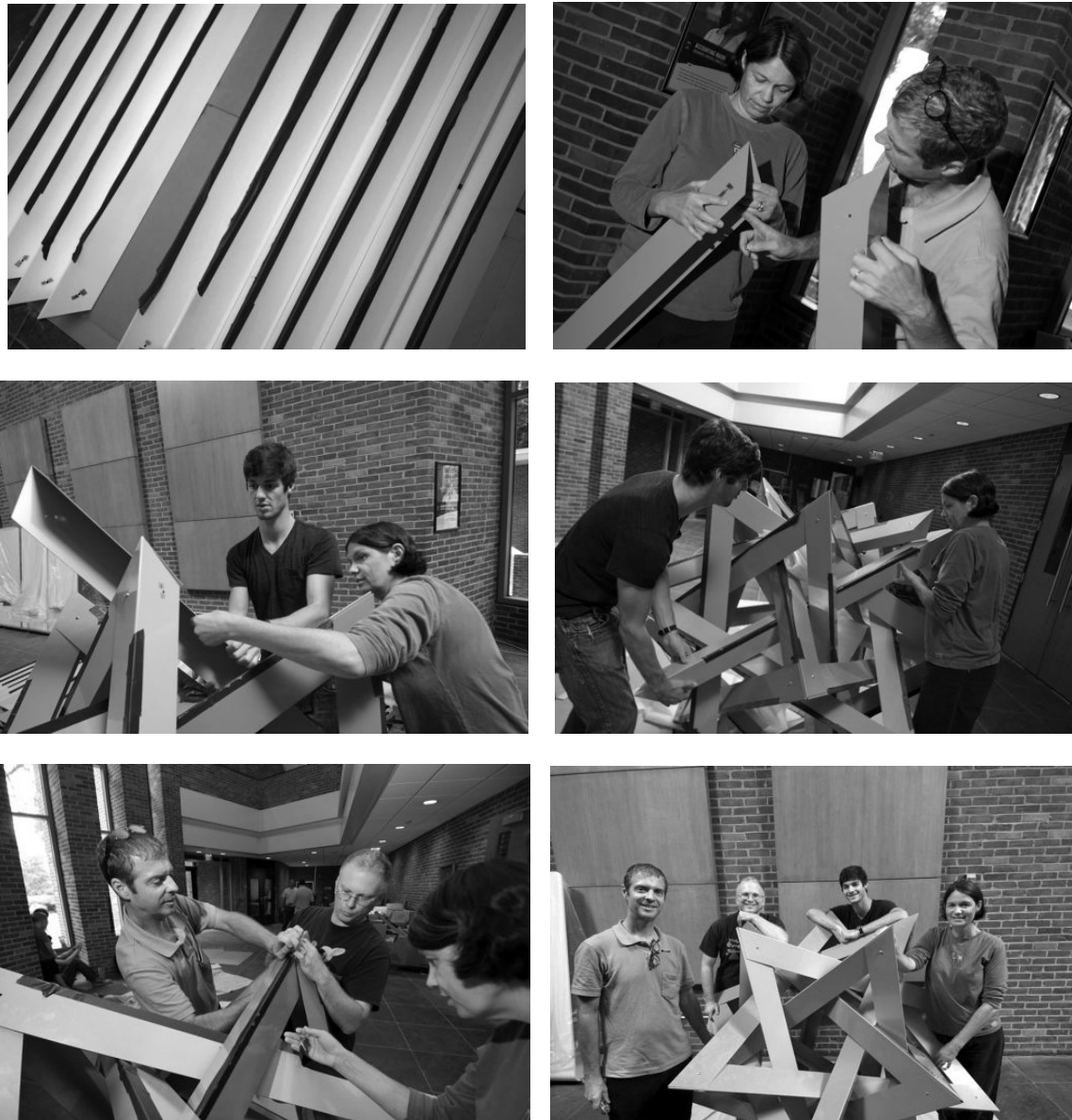
Figure 4: Final assembly

scratches on the powder coating. The final structure weighs only 100 pounds and was professionally installed so we are confident it will safely hang for many years.