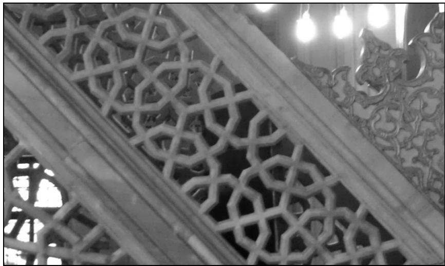
Figure 3 (left) Edirne. Selimiye Mosque (1568-74), interior view with minbar.