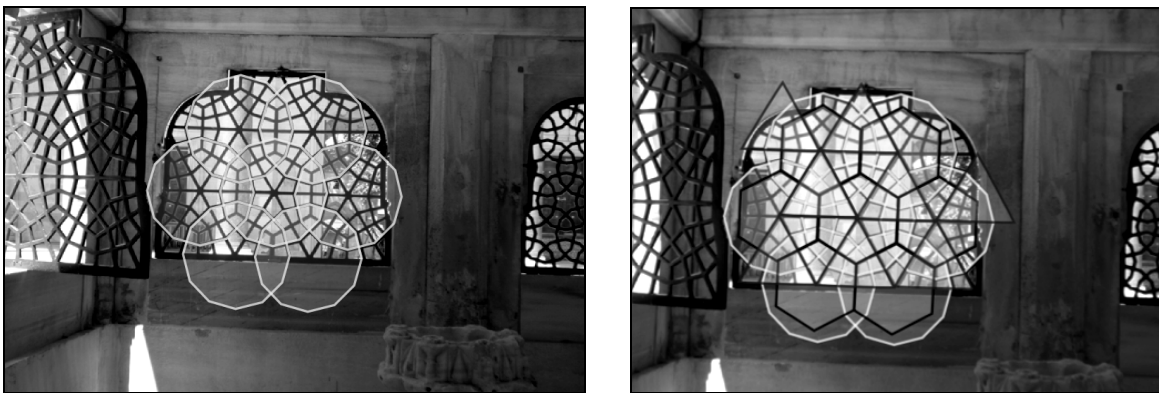
Figure 5 (left and right) Süleymaniye, Istanbul. Interior view of windows of şadırvan (fountain) in main courtyard, showing iron grillwork with intersecting regular dodecagons (left) and dual tessellation of regular hexagons and equilateral triangles (right). Analyses by the author. © C. Bier, 2013.

The Ottoman Turkish word for these works is aḥcār-i müşebbeke , which translates literally to “stone networks,” or “reticulated stones.” Sinan himself was credited with having constructed a primary school having “a walled enclosure surrounded by a most beautifully constructed aḥcār-i müşebbeke ” [14, p.149]. And this form of stone screen was selected by him for use as windows in the enclosure wall surrounding his own burial ground, located at the edge of the imperial mosque complex of Süleymaniye [14, p.150].