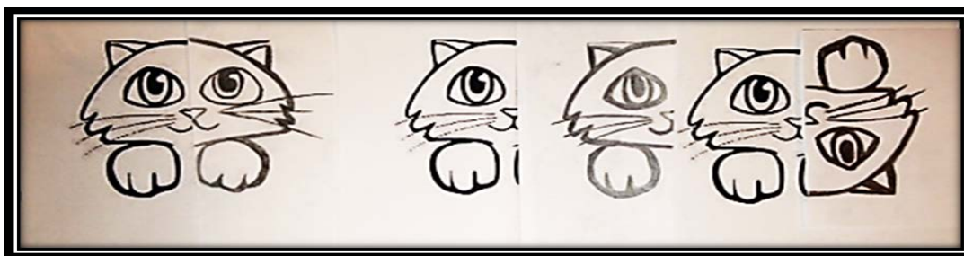
Figure 1: Julie Wingate: MathArt Project Transformations

In this paper, we illustrate how a group of preservice elementary teachers is beginning to rethink their ways of conceptualizing mathematical ideas by developing visual, creative representations of familiar mathematical concepts. Their MathArt project is a part of a longitudinal study focused on developing math-related pedagogical content knowledge [7].