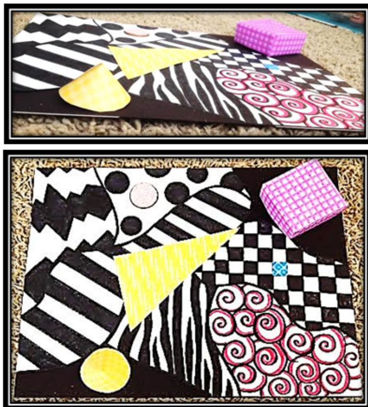
Figure 2: Sierra Hickey: Overlooked (side view and top view)

Julie (Figure 1) writes: “I created three drawings incorporating the mathematical concept of transformation. I took a picture of a cat’s face, and then sketched half of it onto another piece of paper. My artwork uses six of the seven different elements of design. ... I was inspired to do this because transformations can sometimes be intimidating terms for 3rd and 4th graders when first learning them. It gives the chance for the preservice elementary teachers to physically do each transformation while enjoying a creative art project.”