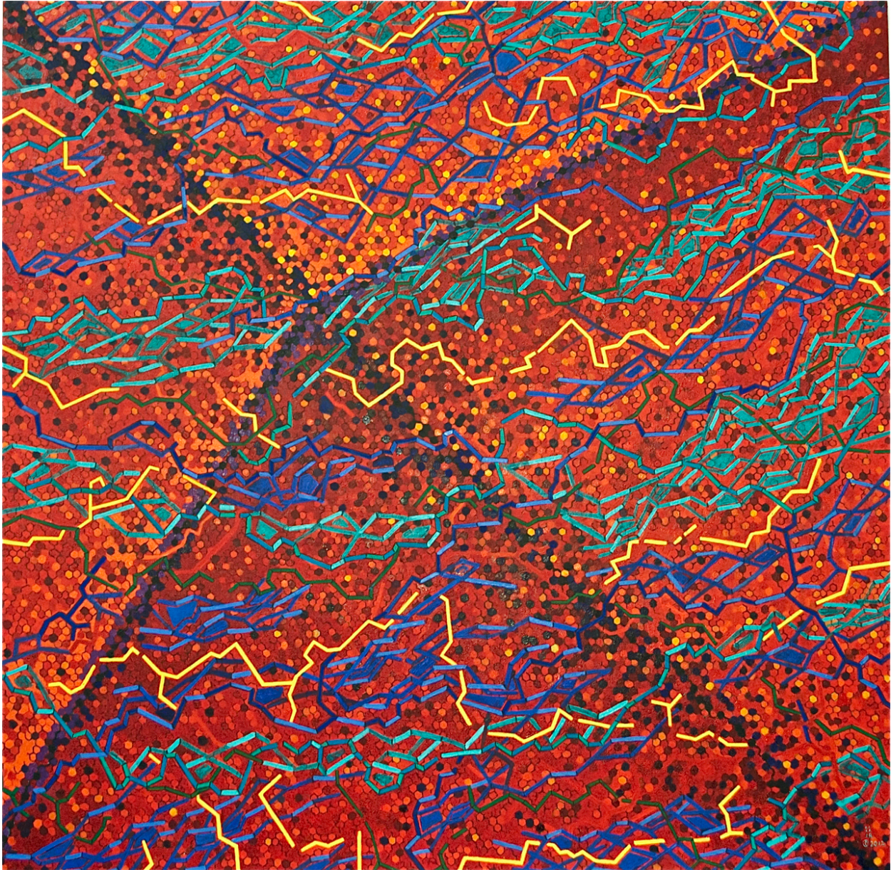
Figure 3: Honeycomb Lattice , oil on canvas 48''x48''x 2 ½'', 2012.

This painting is composed of space-filling hexagons. They shimmer and jiggle in space. The hexagonal framework is a complex tiling pattern. The tiled structure is visually three-dimensional due to the use of varying luminance. Differences in luminance define the red triangles, which are composed of hexagons, as they emerge as three-dimensional forms flipping back and forth depending on the viewer's gaze. These triangles also combine to form a large dart and kite as the central image of the canvas. Superimposed linear networks denote independent planes that visually bend and twist, and advance and recede as they "float" in and out of uncertain spatial dimensions.