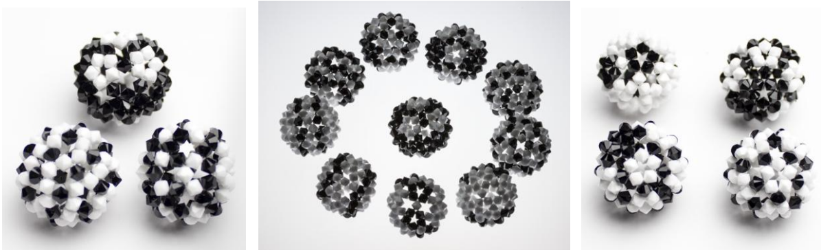
Figure 9: Bi-color Edge Patterns

An exponential number of edge color patterns for the bead truncated icosahedron are possible. Aesthetic considerations influence which patterns are created. I have diagrams for over 40 color patterns at this time. That number grows when I tally all of the potential color combinations. The possible number of pleasing patterns begins to escalate again when I factor in using other types of beads. Other variations to experiment with are changing the shape of the beads and the bead material (glass, crystal, stone, plastic, organic, metal, and more). In the future I will explore changing and combining sizes of beads to create transformational changes in the shape of the truncated icosahedron without changing the pentagon to hexagon relationship. Varying the bead sizes changes the equilateral form of the open planar faces to non-equilateral polygon shapes (see Figure 10).