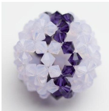
Figure 6: "Zig Zag"