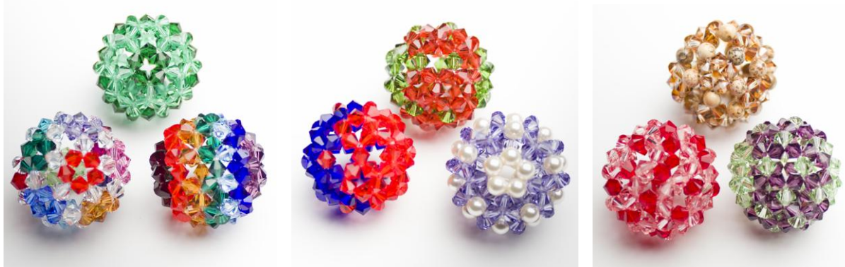
Figure 8: A Variety of Edge Color Patterns

I do not think the singular patterns of one or more beads that I have explored up to this point are particularly interesting. I believe that the aggregate of the 90 patterns of the first group of second colors could be artistically satisfactory if they were strung together, hung as a group mobile, or attached to each other at shared faces with other bead polyhedra. An early pattern that I developed has ten separated second color beads placed equidistantly on the truncated icosahedron. I call it “Ten Points” (see Figure 3).