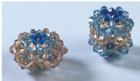
Figure 10: Transformed Truncated Icosahedra