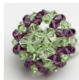
Figure 1: Diagram Net Figure 2: Monochromatic Figure 3: “Ten Points” Figure 4: “Meander”

The step-by-step instructions for the bead truncated icosahedron are 18 pages long (see Figure 1). Please contact the author if you would like a copy.