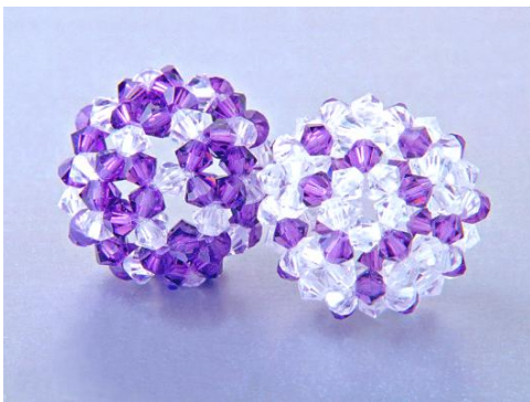
Figure 5: Basic AB "Soccer Ball"