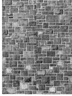
Figure 2: Fixed horizontal translation