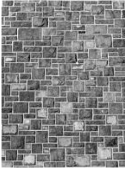
Figure 1: Original image

By understanding each row of the image as a list of numbers that can be shifted and wrapped around (using modular arithmetic), we can transform images in simple ways. Below we see the results of a horizontal translation by a fixed amount (Figure 2), a linearly varying amount (Figure 3), and an oscillating amount (Figure 4).