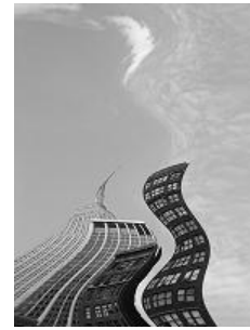
Figure 10: "Building Sines"

Ultimately, students can apply their knowledge of basic image transformations to their own photography, thereby creating art that is both personal and mathematical. In Figure 10, a favorite image of mine has been compressed along a vertical sine wave, producing an interesting visual result.