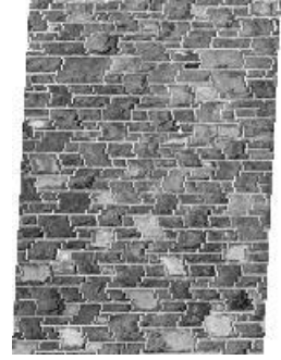
Figure 4: Oscillating translation

In each case, the original image is loaded in Python as an image object named im . The new image, im1 , is created by copying the specified pixel from the original image. Here we see the relevant snippet of code for the fixed horizontal translation (Figure 1).