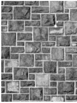
Figure 5: Basic dilation