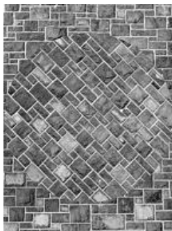
Figure 7: Basic rotation

In order to produce a smooth, continuous appearance in the transformed image, the ideas of weighted averages, limits, and asymptotic functions can be introduced. By appropriately varying a rotation's “strength”, a rotation can be smoothed out as in Figure 8. Again, in addition to applying numerous mathematical concepts in an authentic problem-solving context, students also develop a sense of the basic theory of digital image processing.