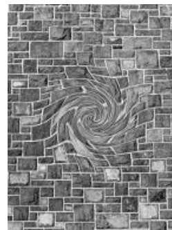
Figure 8: Smooth rotation