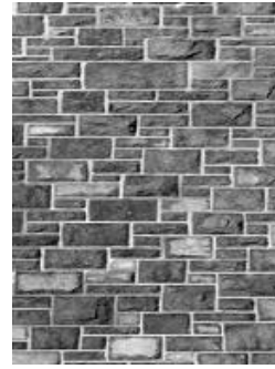
Figure 6: Basic shearing

Producing these simple effects allows students to experience the difference between various linear transformations in a meaningful context. It also requires that students understand mappings of the plane as functions whose domain and range correspond to the original and desired images; in fact, image processing offers a rich environment to explore the concept of function, as discussed by S. Tanimoto [4].