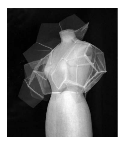
Figure 2: Bolero made out of three deconstructed dodekahedra by Walter Lunzer.