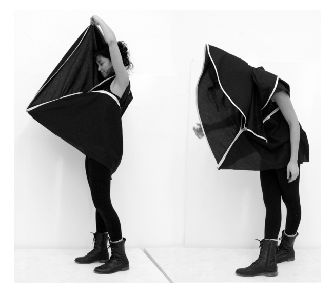
Figure 3: Prototype for a Body-Index-Cloth by Jasmin Schaitl.