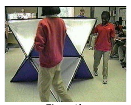
Figure 10 : Turn and stop game

This provides an opportunity to demonstrate rotational symmetry about the observed vertical axes going through vertices, edge midpoints, centers of faces, and the centers of the whole shapes. The turn and stop game (figure 10) is an interactive way to investigate the rotational symmetries of polyhedra. The polyhedron is rotated from an initial position, by students walking around with