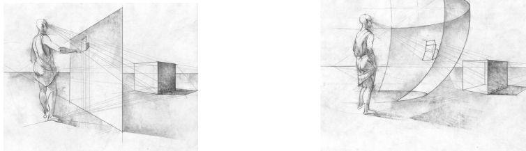
Figure 1: Picture on the plan and on the sphere, Csaba Szegedi [5]

Representation, visualization, the problems of visual communication all belong to the basic questions of visual arts as well as of architecture and design. However the traditional (linear) perspective systems with one, two and three vanishing points correspond with our photographic way of seeing, they cover quite narrow part of the space effectively perceived by us. In view of the peripheral distortion of the linear perspective systems practically only one single point can be represented accurately. Installing new vanishing points helps to wide the field of view and avoid distortion. With three vanishing points an eighth part of space can be represented and each following vanishing point will duplicate the extent of the view. With the sixth vanishing point the whole space around the spectator can be shown on a single picture. [1],[2],[4]