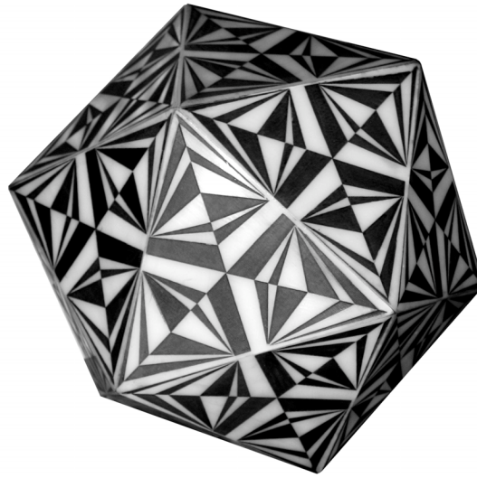
Figure 3 The icosahedron patterned with counterchange pattern class p6m/p6 (created from laser-etched and painted acrylic)

Figures 3 and 4 show illustrations of the icosahedron patterned with counterchange class p6m/p6 . The model shown in Figure 3 is based on the design previously illustrated in Figure 2, where the area of the pattern that is applied to each face is equivalent to half the unit cell. In Figure 4 an area of pattern equivalent to two unit cells is applied to pattern each face. In both instances, all faces are identical.