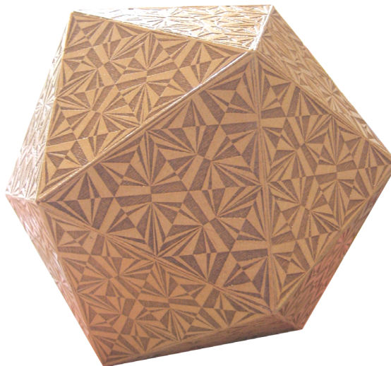
Figure 4 The icosahedron patterned with counterchange pattern class p6m/p6 (created from laser-etched wood composite)